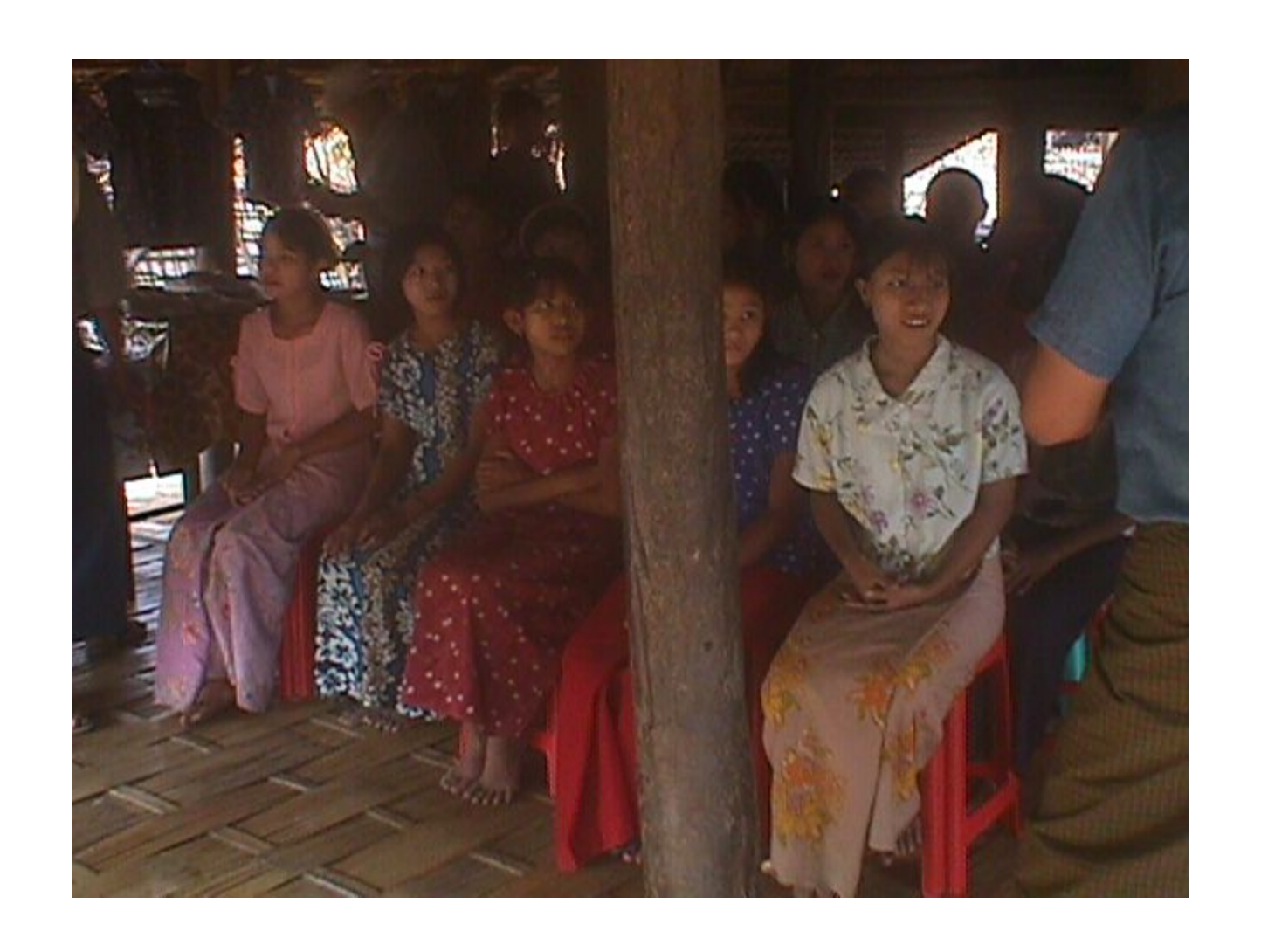
Women from Self-reliance Groups gather a three day AI event