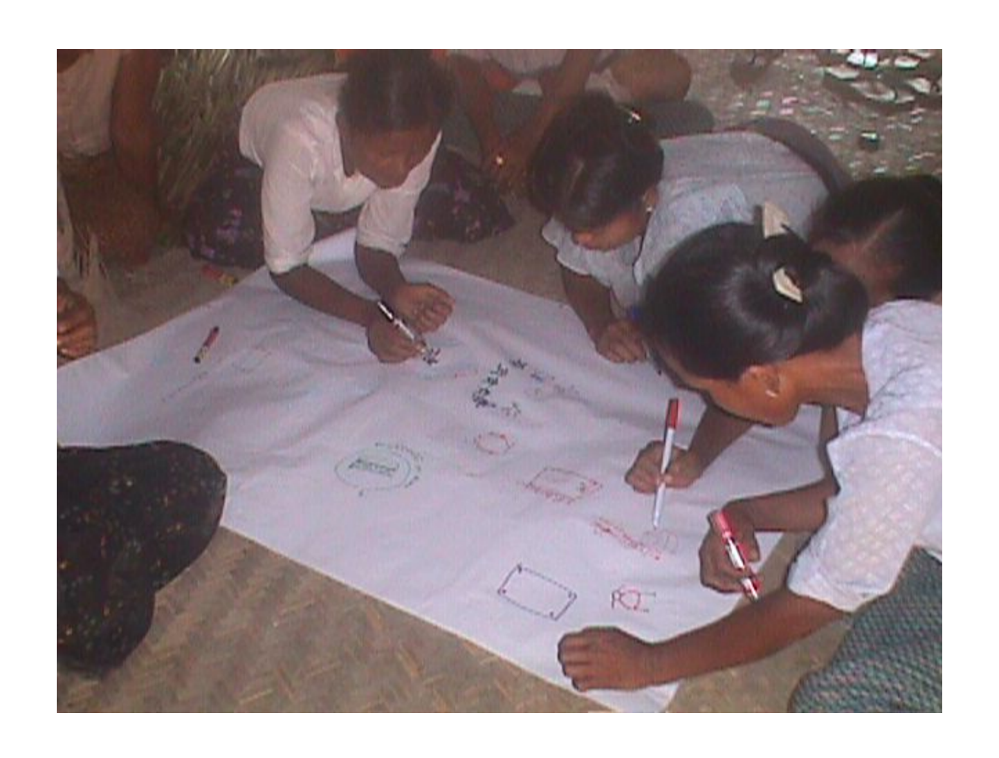
Women draw their future wishes and visions