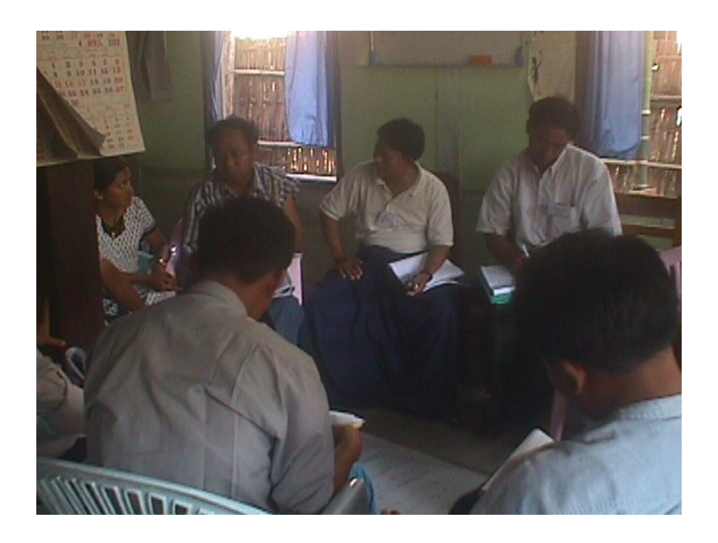
Preparing for facilitation with Myrada trainers