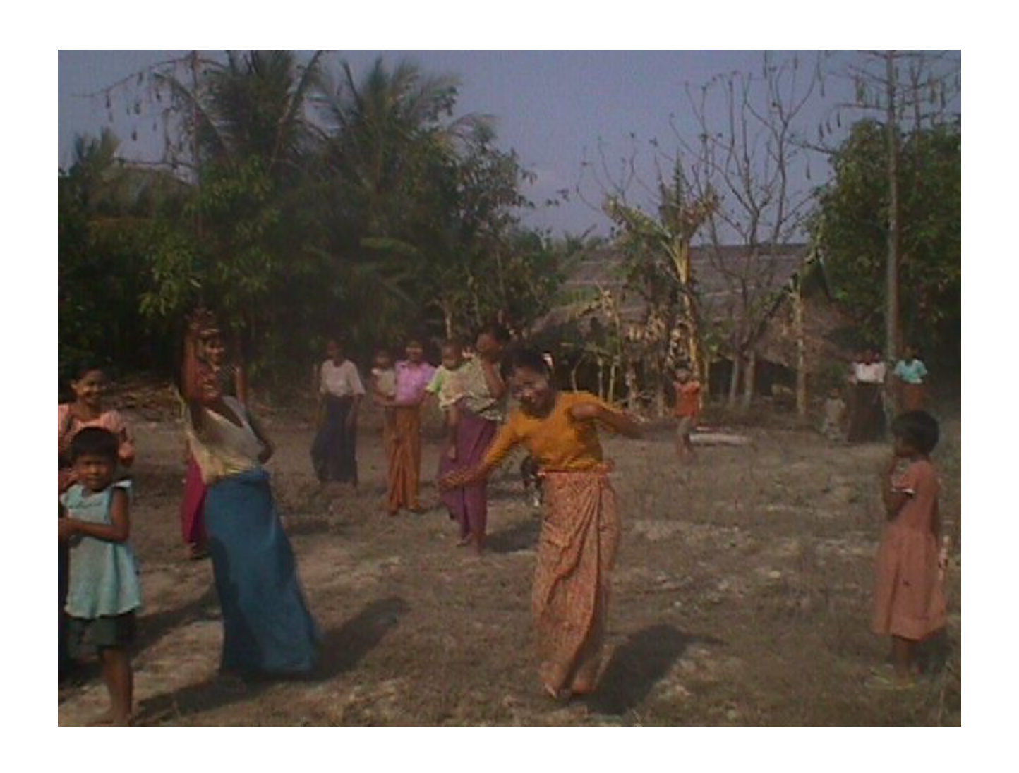
A time to celebrate in the midst of hardship