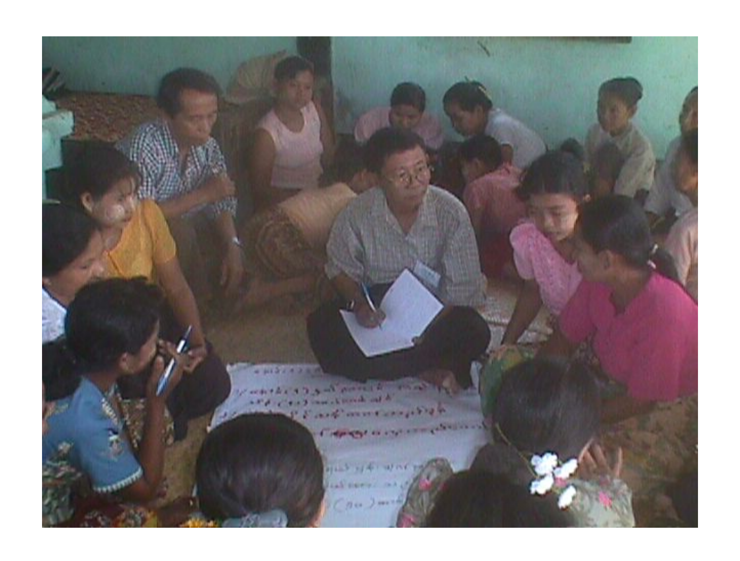
Storytelling in progress – strengths and peak moments are gathered from the stories of success