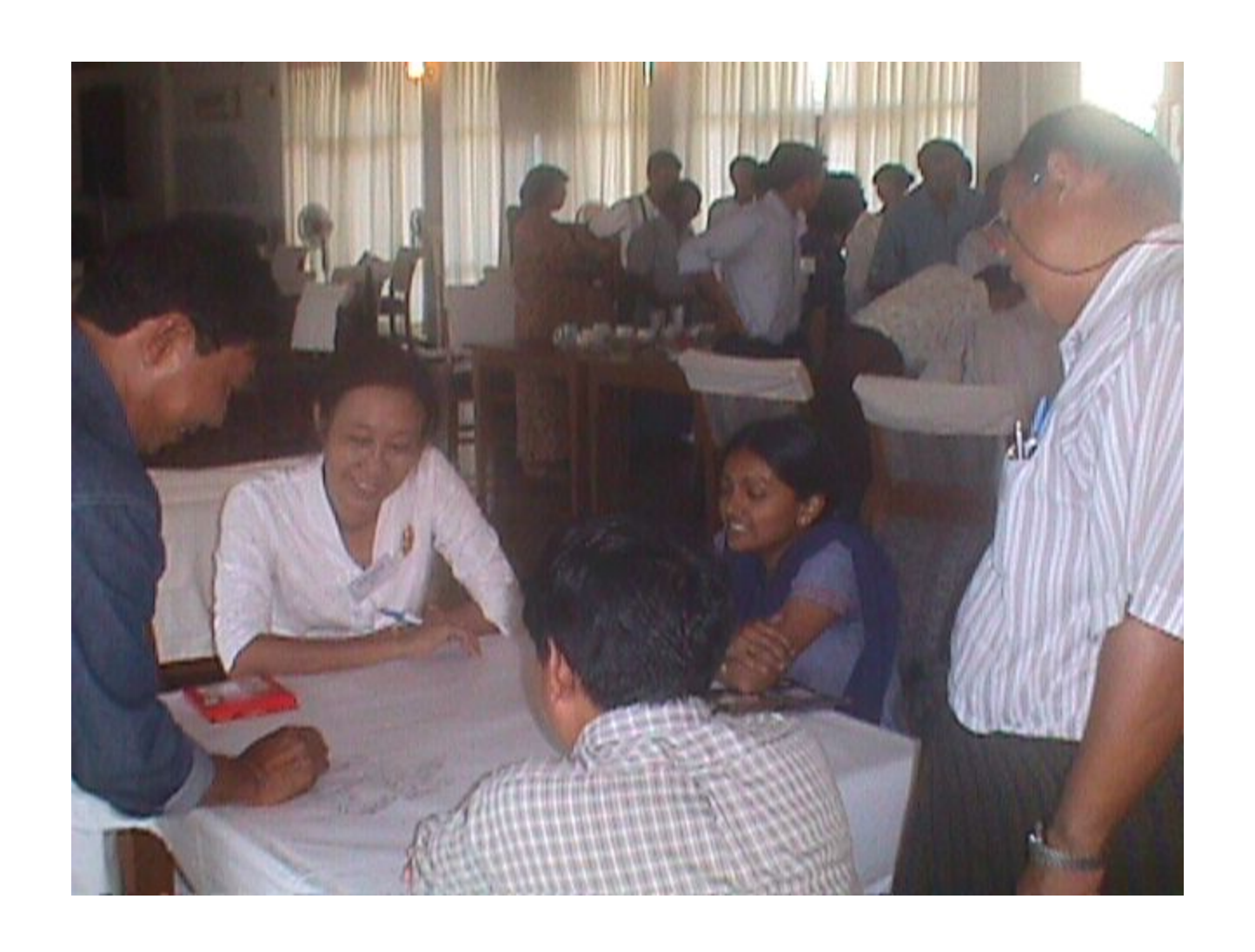
The UNDP facilitators now reflect on how things went...